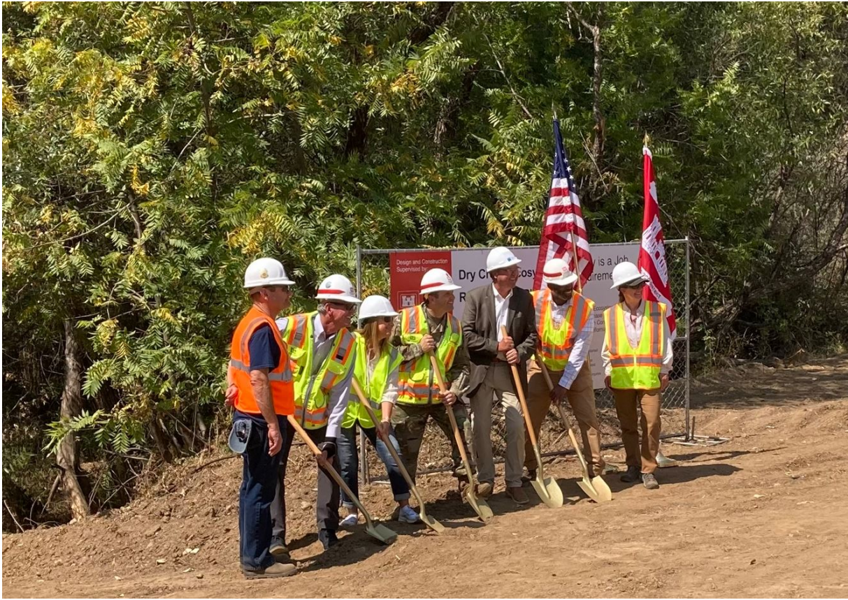
Dry Creek Reach 13 Groundbreaking Ceremony. August 16, 2022.