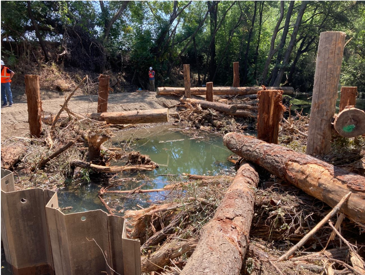
Dry Creek Reach 13 under construction. August 16, 2022.